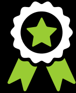
Quality Assurance Programme

Visit www.excel-networking.com for the full product details