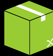
Extensive Product Range