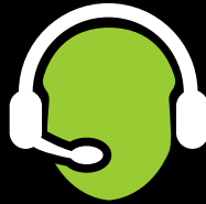
Dedicated Account Manager